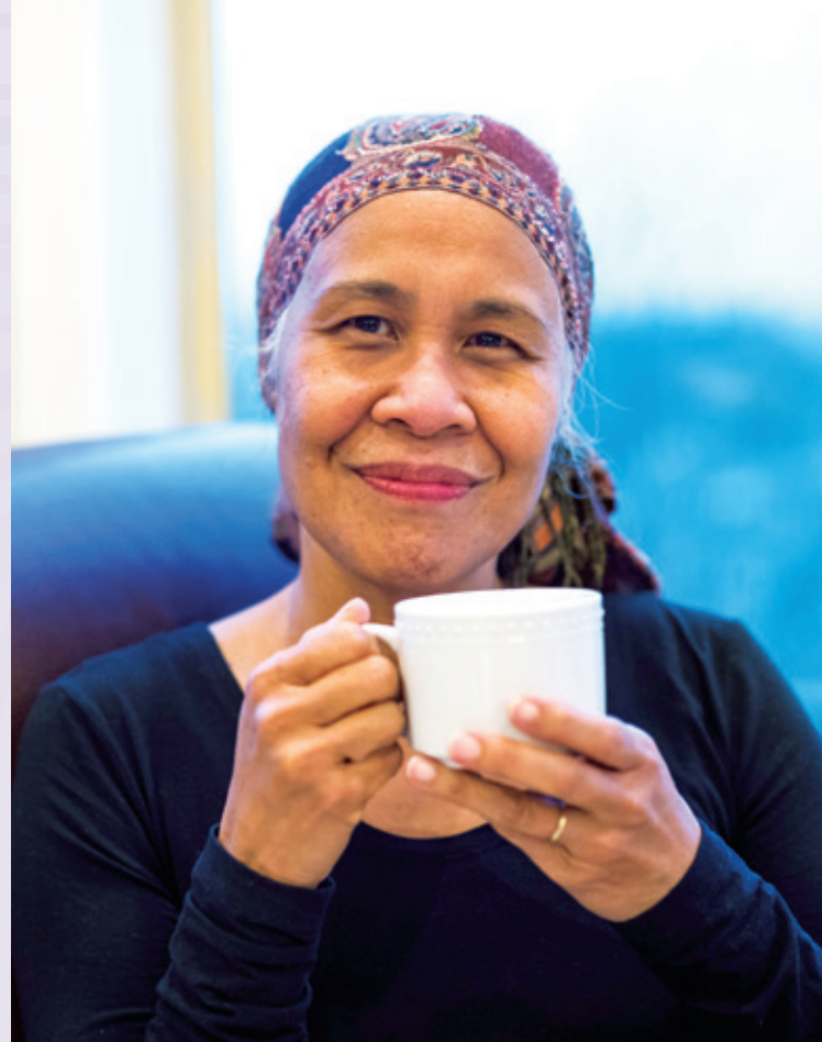
Top five leading cancers for men and women in Hawai'i

In 2016, there were over 62,200 Hawai'i residents living with cancer. 2 The annual incidence rate from 2012–2016 for all cancers combined was 426 per 100,000 in males and 400 per 100,000 in females. 2 Breast cancer is the most common cancer among women, and prostate cancer is the most common cancer among men. 2